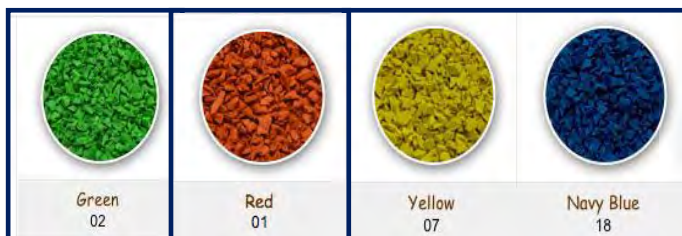
EPDM Colour blends

NB: Other colours are available on request