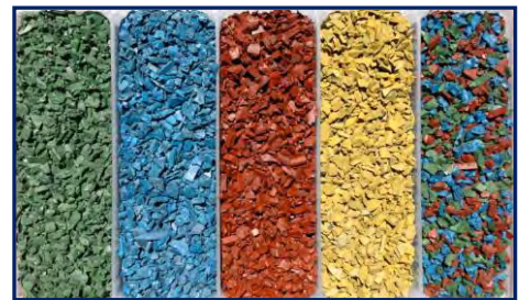
Coloured SBR colour choices

Description: SBR safety recycled rubber granules Materials: SBR pigmented shredded rubber Packaged: 25kg Bags Colour: Green, Blue, Red, Golden Yellow, Jazz Spreading Ratio: 1x25kg will cover approx 2m 2 Binder Mixing Ratio: 1 Bag per 5 Litres of binder