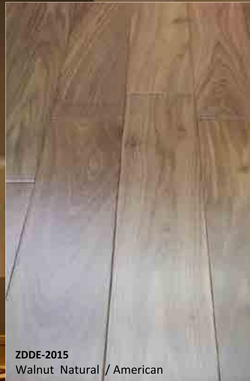
ZDDE-2015 Walnut Natural / American

If needed, installed engineered floors can be taken apart and re-installed elsewhere.