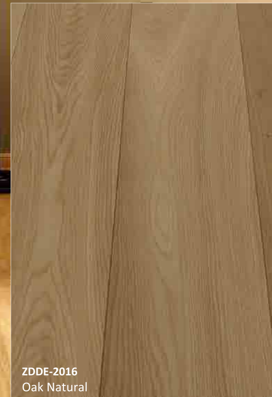
ZDDE-2016 Oak Natural

EDGE CONNECTION Beveled Edge Click Lock System