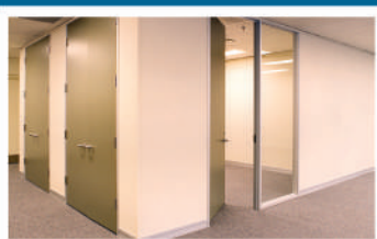
Gypsum Partition & Alum/ Glass Doors