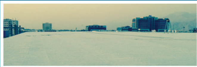
Roof Water Proofing