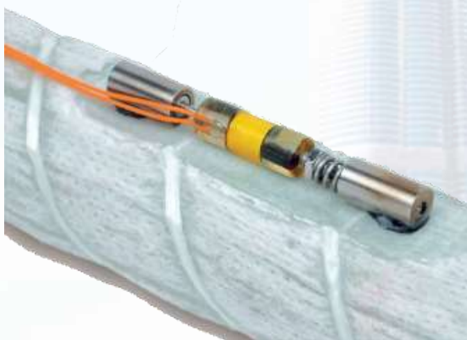
Miniature and Extended Range