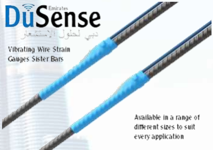
Vibrating Wire Strain Gauge Sister Bar

Available in a range of different sizes to suit every application