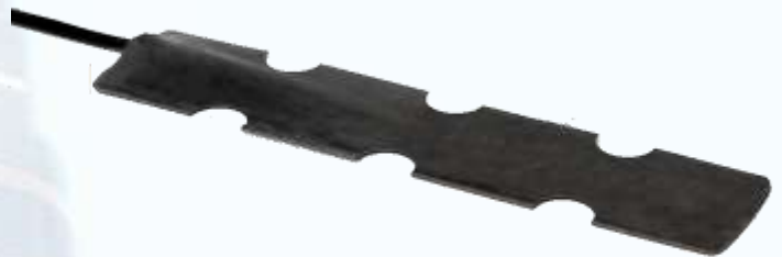
Fiber Optic Strain Gauge