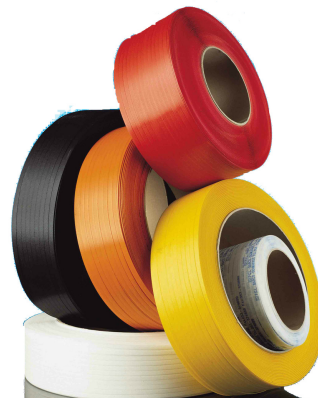
PP & PET STRAPS