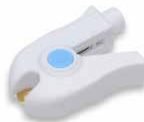
Banana To Clip Adapter