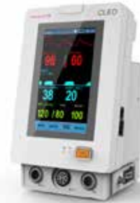
Vital Sign Monitor