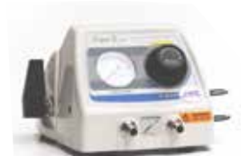
Cryo Mim Cryo S