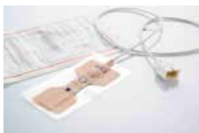
Disposable Spo2 Sensor