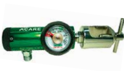
Pin Index Oxygen Regulator