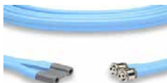
WELCH ALLYN NIBP Hose