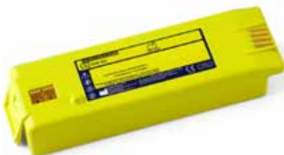
Cardiac Science battery