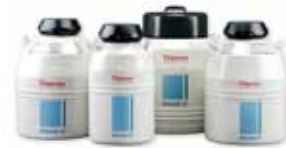
Cryo Storage Cans