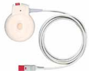
Toco & Us Transducer