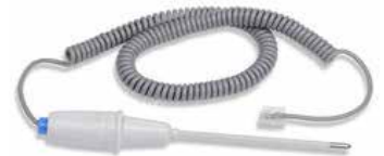
DINAMAP Temp Probe