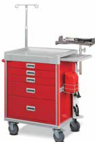
Crash Cart/ Emergency Trolley