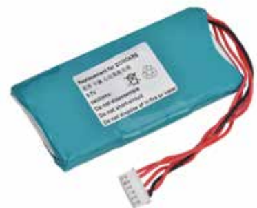
Vital Signs Monitor Battery