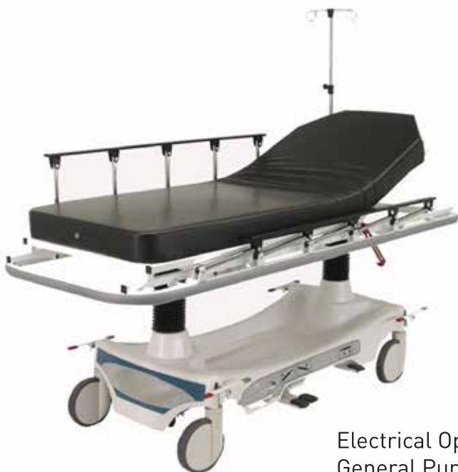
Electrical Operated General Purpose Stretcher