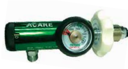
Bull Nose O2 Regulator