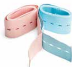
Disp. Ctg Belt