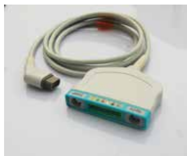
Multipod Trunk Cable