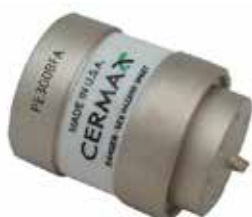
Xenon Lamp PE175BFA