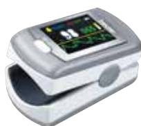
Finger Tip Pulse Oximeter