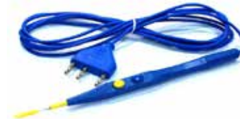
Disposable Esu Pencil 1