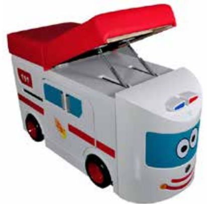
Paediatric Examination Chair