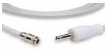
PHILIPS NIBP Hose