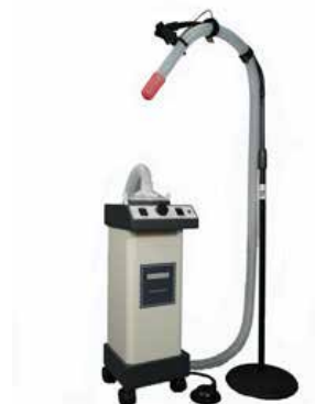
Laser Smoke Evacuator