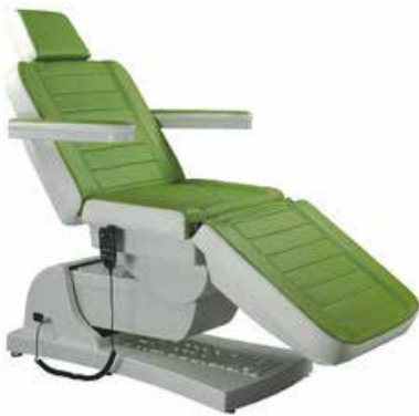
Dermatology Laser Chair