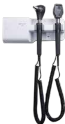
Wallmount Diagnostic Set