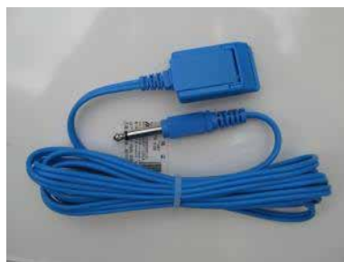
Esu Groud Cable