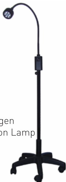
LED/ Halogen Examination Lamp