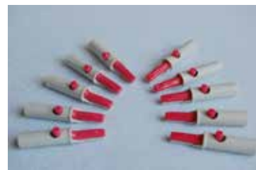
ECG Crocodile Clip