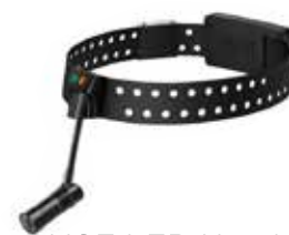
NSE LED Head Light Battery Operated