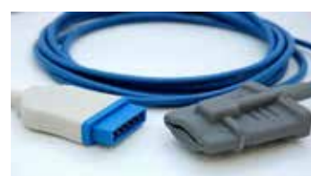
GE Dash 4000 SP02 sensor