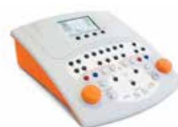
Digital Audio Meter