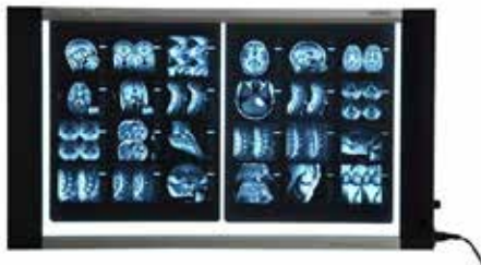
LED X-RAY Viewer