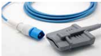
Philips SP02 Sensor