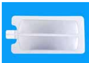
Disposable Esu Ground Plate