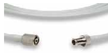
NIHON KOHDEN NIBP Hose