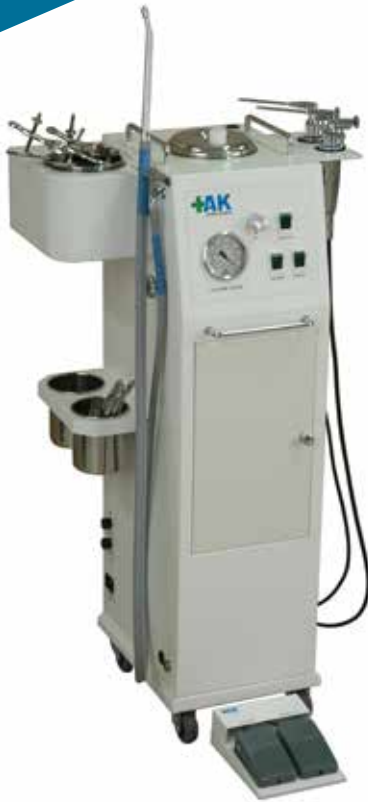
Gynecology OPD Unit