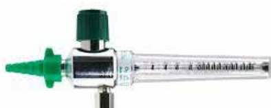
Oxygen Flow Meter