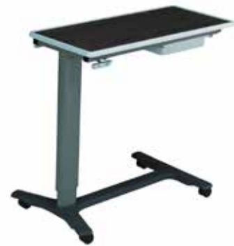
Over Bed Table