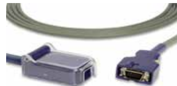
Doc 10 SP02 Extension