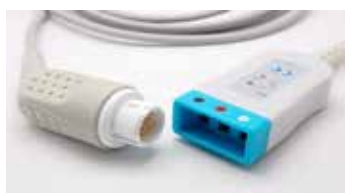
Ecg Trunk Cable