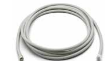
COLIN NIBP Hose