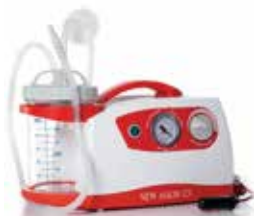
Suction Unit - Battery Operated