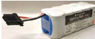
Nihon Kohden NKB-301V