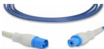
Philips SP02 Extension