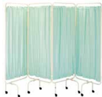
4 Fold Ward Screen