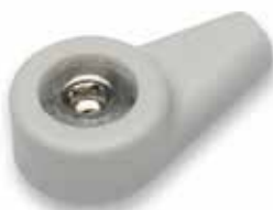
Banana To Snap Adapter