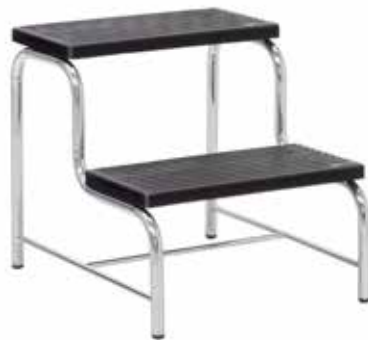
Two Step Stool