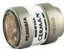
Xenon Lamp PE300BFA