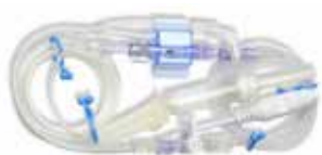
Disp IBP Transducer