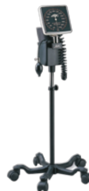
Mobile Anaroid BP