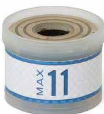
Max 11 Oxygen Sensor