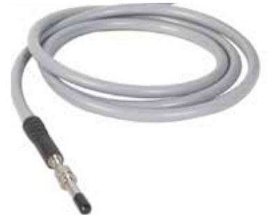
Fiber Optic Cable