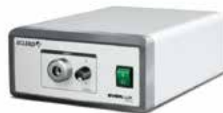
ENT Light Source