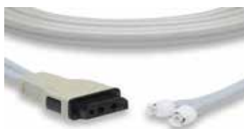
GE NIBP Hose