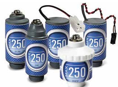
Max 250e Oxygen Sensor