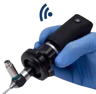
WIFI ENT Camera