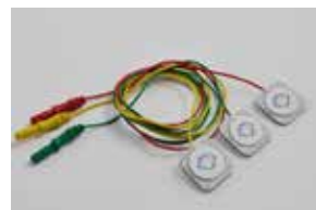
Disp ECG Leads