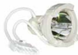
XBO R 180W 45C