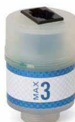
Max 3 Oxygen Sensor