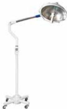
Mobile OT Light