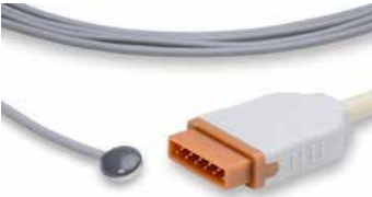
GE Temp Probe