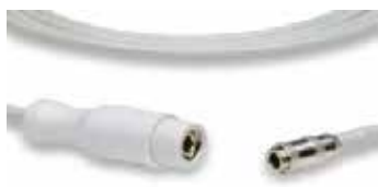
DRAGER NIBP Hose