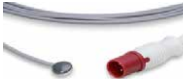
PHILIPS Temp Probe