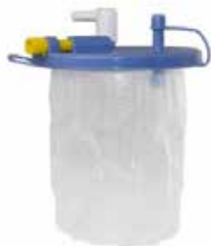
Disp. Suction Liner 1 Ltr./ 2Ltr./3Ltr.