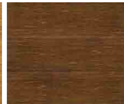
• BM 2400 AMAZON