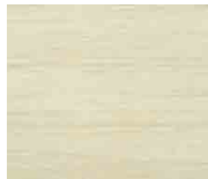
• BM 2000 EVEREST