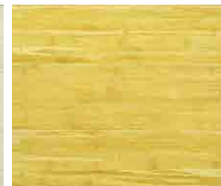
• BM 2100 NATURAL