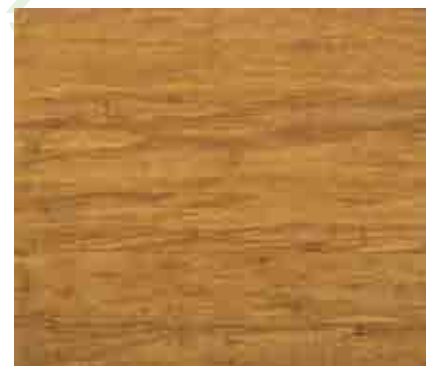
• BM 2200 EARTH